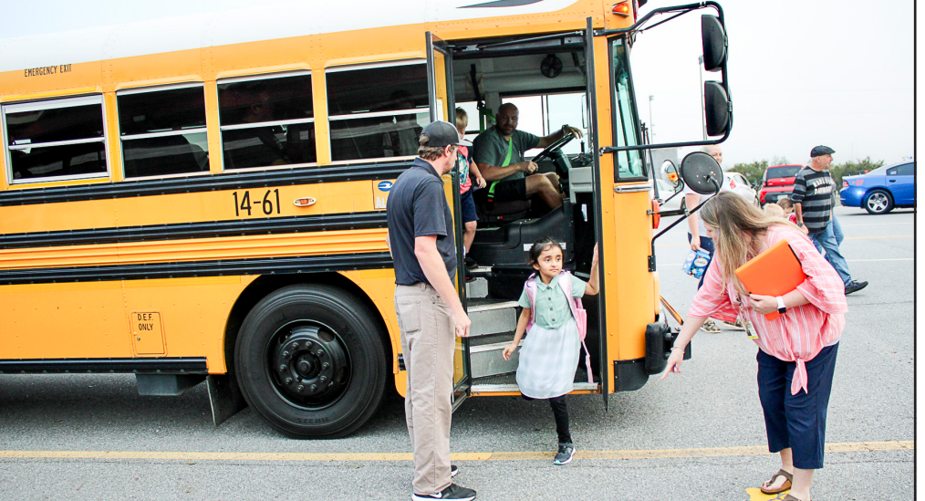
Be sure to watch out for buses as they roll through the community this school year! Let's keep the kiddos safe.