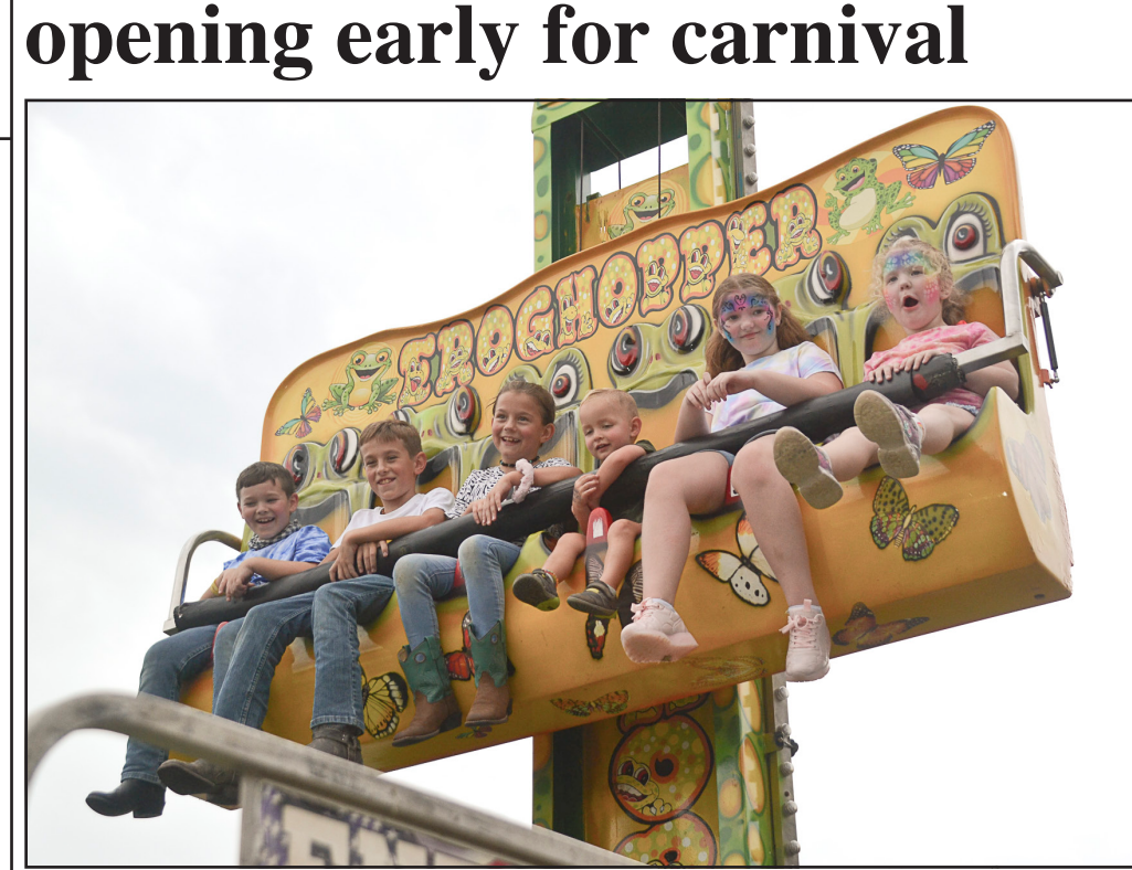
Families from all over will be flocking to the 2023 Georgia Mountain Fair for many reasons. including the massive carnival that opens Thursday.