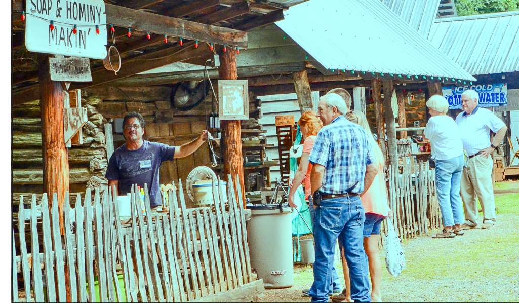
People can look forward to a revamped Pioneer Village at the 2023 Georgia Mountain Fair, where they can learn all about local heritage and the people who helped make the community what it is today.

out the Check official website at www. georgiamountainfairgrounds. com for more details or give a ring to 706-896-4191 for answers to any questions.